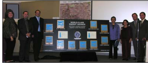
Gresham-Barlow School District receiving ENERGY STAR Leader Award.

Service plays an enormous role in choosing our partners. Working with a knowledgeable technical support staff that is capable of trouble-shooting complex issues over the phone or on-site is critical for our environment. This is an area where ECC stands out from other controls companies.